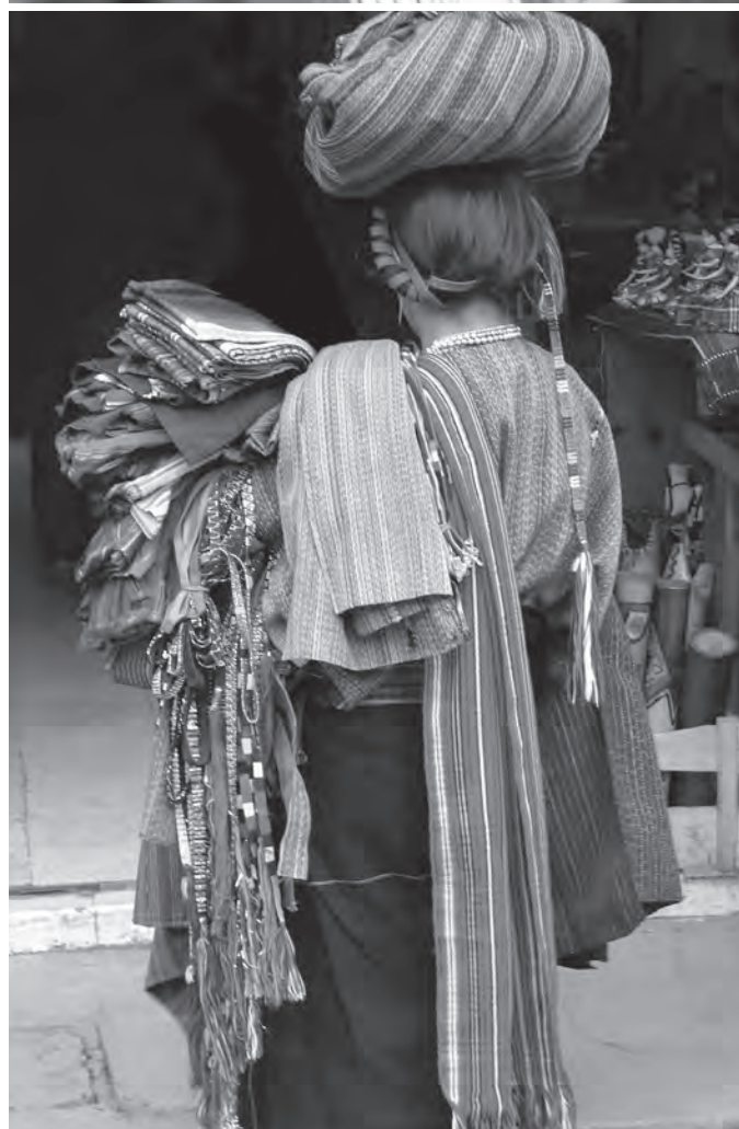
FTGA families experience the rich culture in Guatemala.